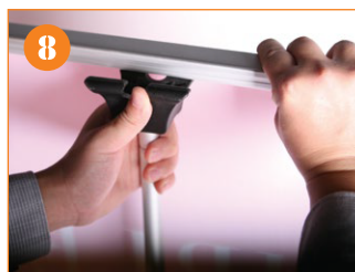
8. Pull one graphic and connect the pole hooks to the top profile.