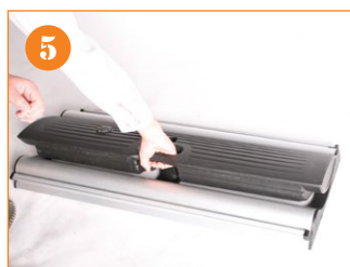
5. Place the water tank back into the base.