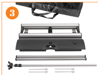
3. Place all the hardware parts on the ground.