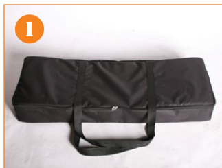
1. Vela canvas bag with stand.