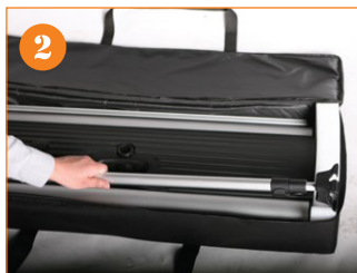
2. Take out the hardware and pole from the bag.