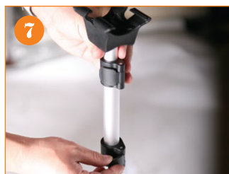
7. Open and close the clip to adjust the height of the pole.