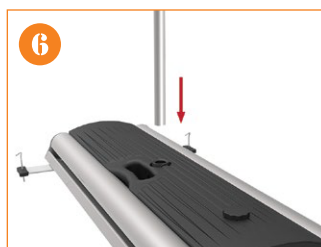
6. Insert the pole into the base.